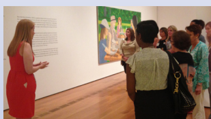
July 2015: Atlanta outreach event at the High Museum