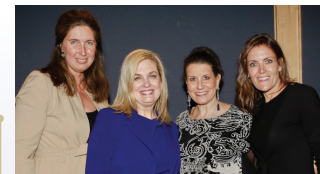
May 2016: Inaugural Women of Distinction Award in NYC, in partnership with the FSU Alumni Association and Seminole Club of New York City