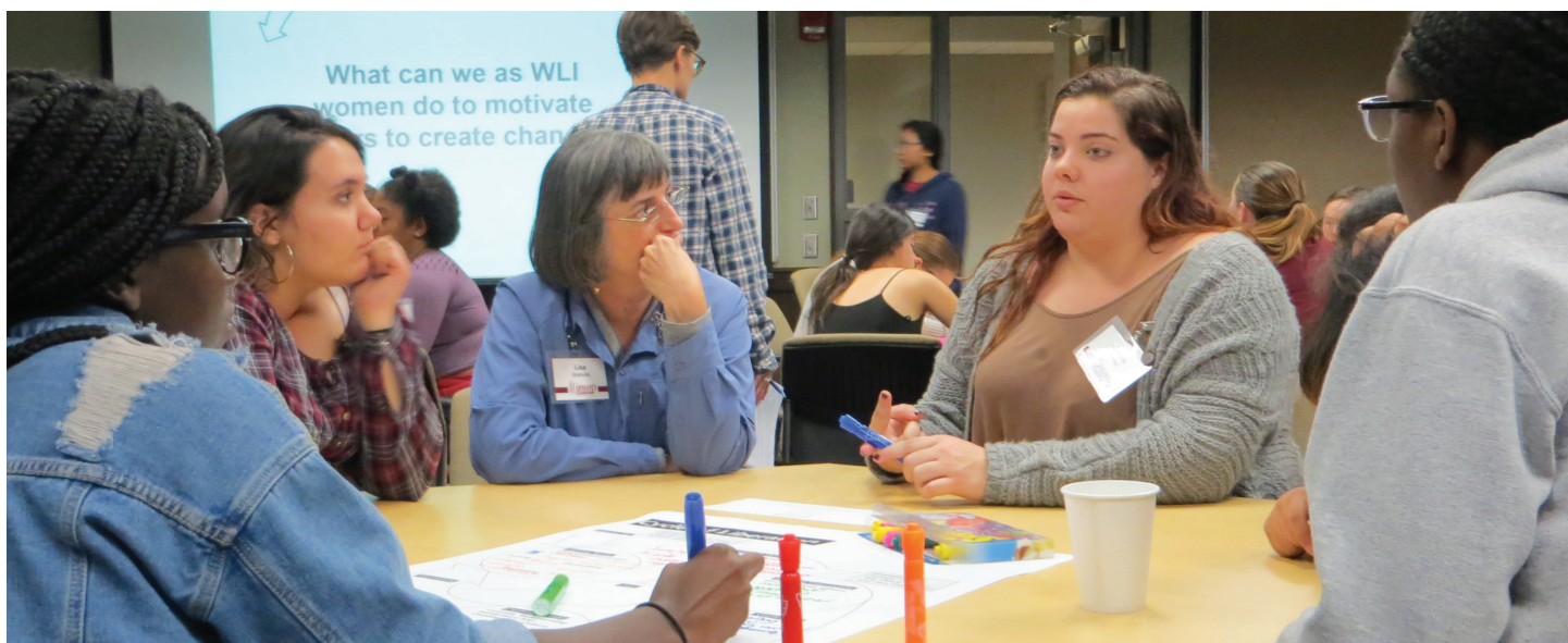
Participants discuss how together as WLI women, they can encourage and create positive change in their communities.